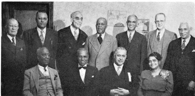
Past Presidents and Past Secretaries, K. N. E. A.

We urge attendance at all district meetings and the next meeting of the Librarians' Section of the K. N. E. A.