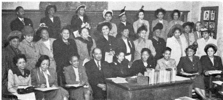
Conference—Teachers of English

"Life is before you, from the fated road You cannot turn; then take ye up the load. Not yours to tread or leave the unknown way, Ye must go o'er it, meet ye what ye may. Gird up your souls within you to the deed, Angels and fellow-spirits bid you speed."