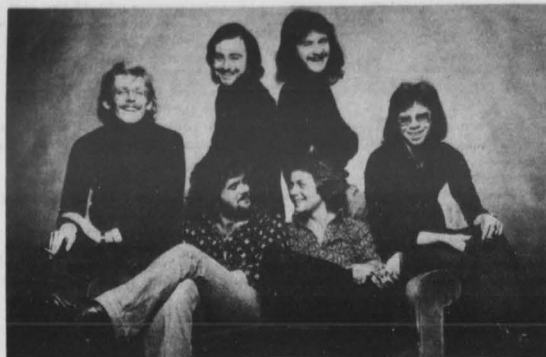
City Boy: Gentlemen's rock

Consider what it would cost you if the other side got you