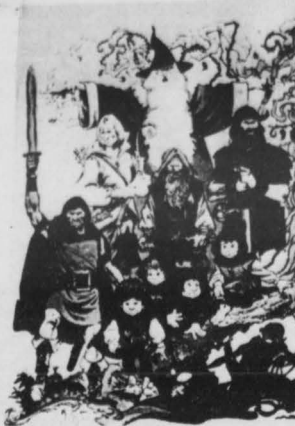
"Lord of the Rings" will be shown at 7 and 9:30 p.m. in the University Theatre.

The NKU Varsity Club is sponsoring the first annual Spring Road race at 1 p.m. on the NKU campus. The run is open to the public and features four age divisions for both men and women. Trophies will be awarded to the top runners in each division, with medals given to the top five places. Ribbons will be awarded to all finishers. The pre-registration entry fee is $2.00 and the day of the race entry fee is $2.50. A special NKU race ill be free to university students, faculty and staff.