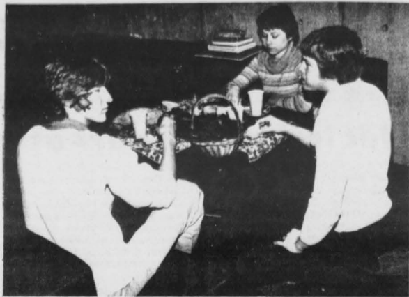
"A loaf of bread, a jug of wine..."

According to Turner, "We proposed about $15,000 for the '78 book, but a $7,000 carryover in bills from the 1976 book left us with about $7,000." Turner and other members of an editorial board replaced 1976 editor Greg Poe in spring 1977 after he was fired by the Publica-