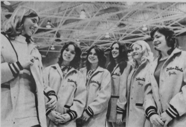
VETERAN MEMBERS of the Golden Girl drill team model their new jackets. The jackets represent two years of participation on the drill team and were presented to the woman at the December 23, NKSC-Thomas