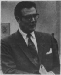
Rep. John Breckinridge