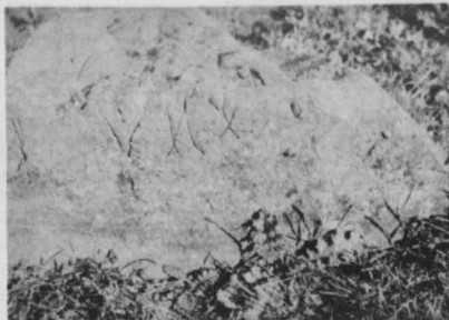
— ROCK TELLS THE STORY —