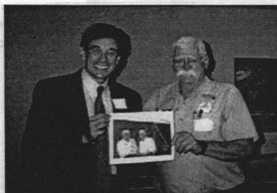
First the Governor, now the President, what next...