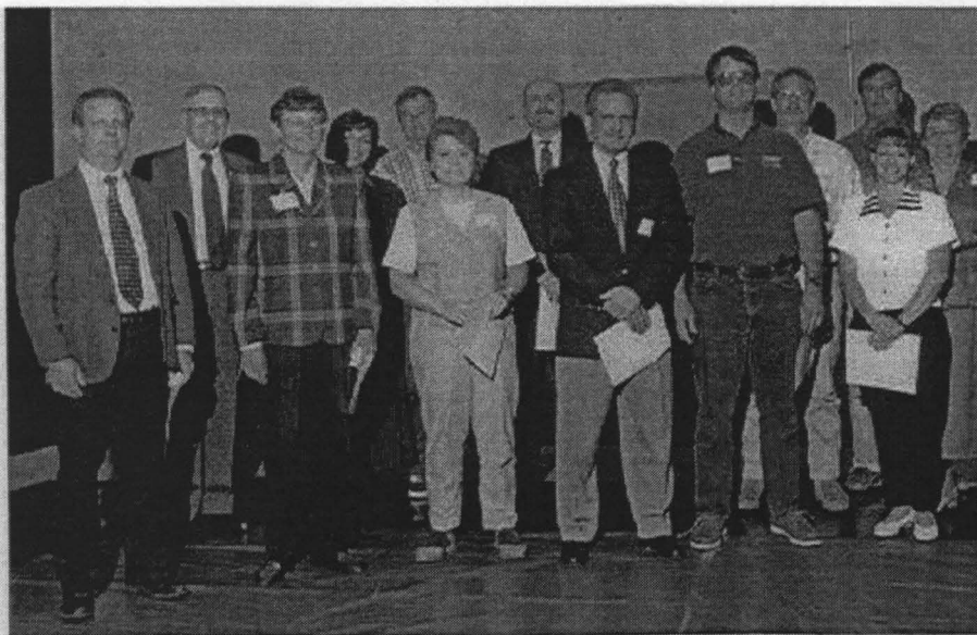
Twenty Years of Service