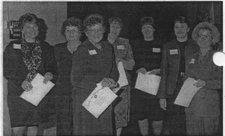
Fifteen Years of Service