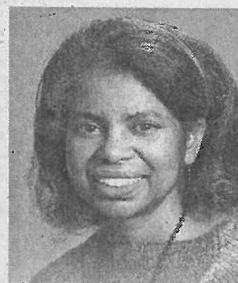
2006 Elizabeth McMillan-McCartney Faculty Developmental Mathematics